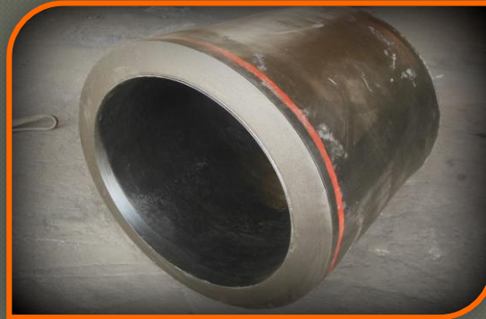
Successfully Executed 28" & 24" 75mm Thick Reducer of P-22 (AS) Material