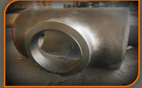
Successfully Executed 28" , 26" & 24" 75mm Thick Reducing Tee of P-22 (AS) Material