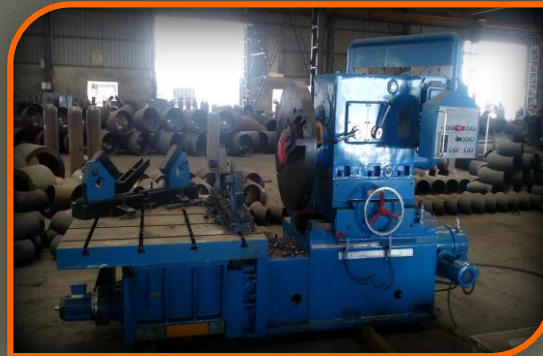
Installed New Automatic Beveling Machine up to 30 Inch Fittings & Pipes