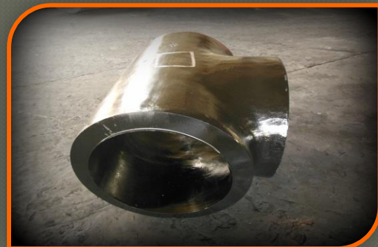
Successfully Executed 28" 75mm Thick Straight Tee of P-22 (AS) Material