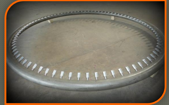
Successfully Executed 5" Stainless Steel Manifold